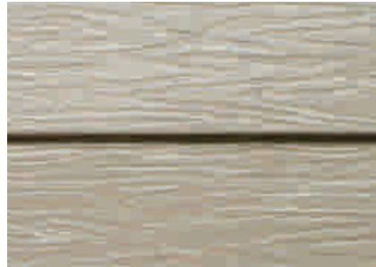
5" Clapboard Siding

Satinwood Variegated Steel Siding is available in four multi-toned colors each representing the genuine look of stained cedar. A unique manufacturing process provides a non-repeating woodgrain pattern for realistic wood-like appearance. Available in both a double 5" clapboard and single 8" clapboard to accentuate your home's architectural style. With your individual preferences in mind, Satinwood Variegated Steel Siding has been expertly designed and skillfully finished to reflect the natural grain of stained cedar siding – without the headache of continual maintenance.