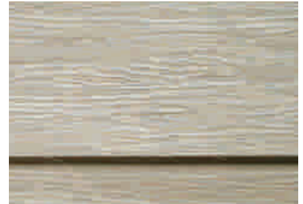
8" Clapboard Siding