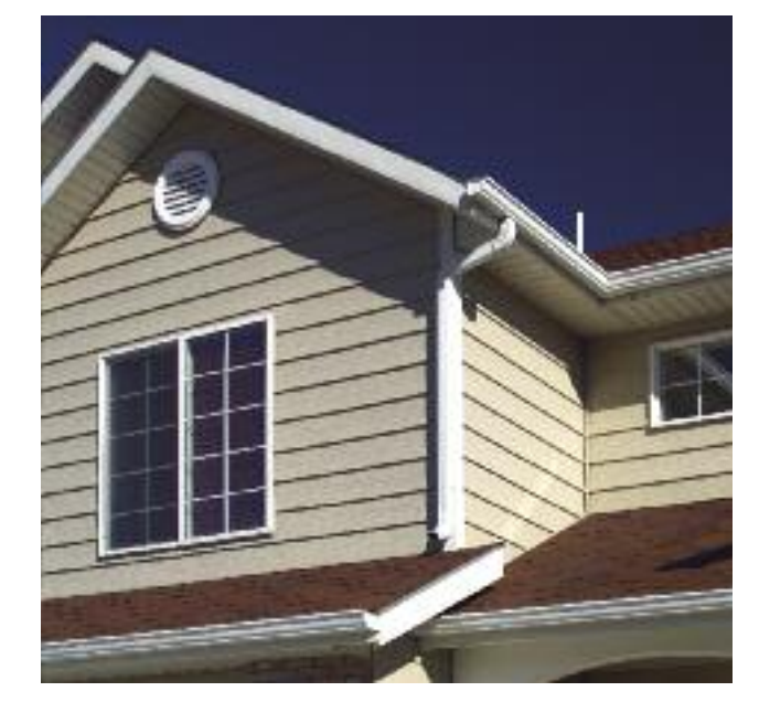
Satinwood 8" clapboard in Monterey Sand.

Satinwood Steel Siding is constructed of galvanized steel and fused with a top coat of PVC – a process which adds lasting integrity to your home. The low-gloss finish and color-fast texture lend appeal, and capture the warmth of freshly painted wood, yet requires only minimal attention. Satinwood Steel Siding will deliver optimal performance year after year.