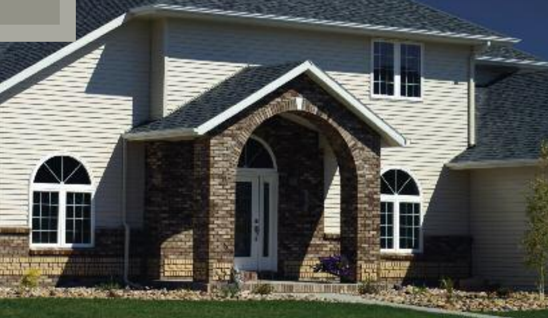
Above: Satinwood double 4" clapboard in Platinum Gray.