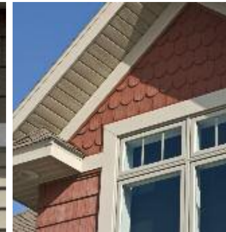
Alside Premium Scallops – Victorian inspired half-round shingles.