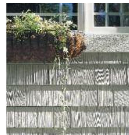
Alside Premium Shakes – the classic look of deep-grained cedar shakes.