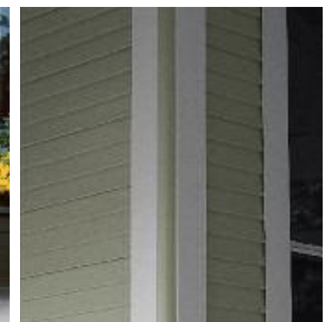
Trimworks® three-piece beaded corner post.