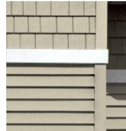
Horizontal band board provides a strong horizontal accent.

Note: Colors are as accurate as printing techniques allow. Make final color selections using actual vinyl samples.