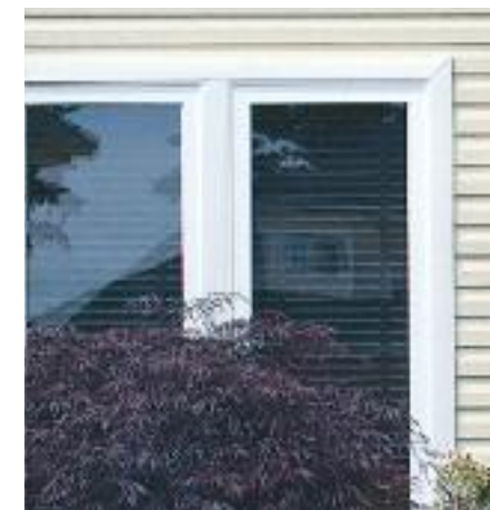
Trimworks® 3 1/2" window trim.