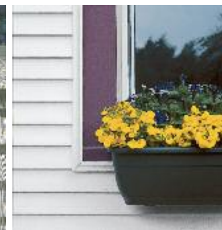
Trimworks® custom crown molding used with wood window trim.