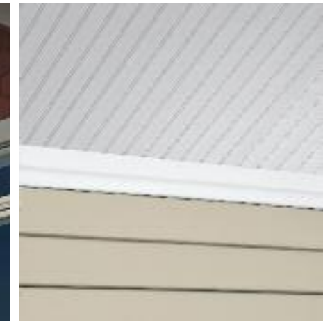
Greenbriar® Vintage Beaded soffit and Trimworks® soffit crown molding.