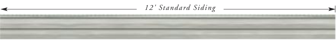
12' Standard Siding

Charter Oak XL comes in an attractive oak grain texture and a choice of 4½" clapboard or dutch lap profiles, as well as 22 popular colors.